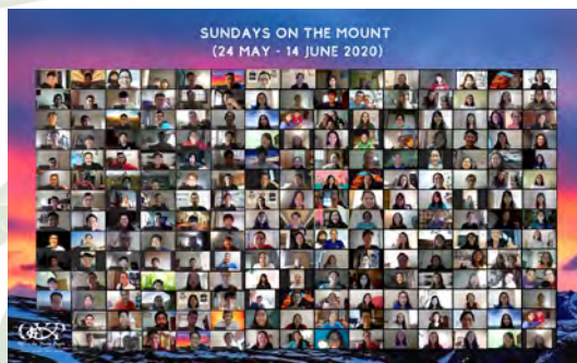
Participants of Sundays on the Mount

Up to 400 participants gathered online over the past 4 Sundays for the first series of Sundays On The Mount. We reflected on 4 key movements in our Christian living; an exhortation to journey from existence to eternity, slavery to sonship, lost to loved and broken to blessed. We praise and thank God for His abundant grac-